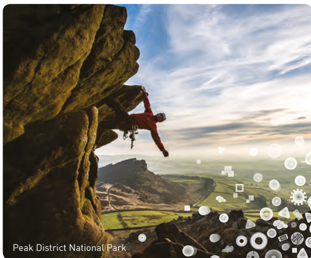
Peak District National Park

A 20 minute drive from Stoke-on-Trent will take you into the stunning beauty of the Peak District National Park. Here you'll find that the miles of moorland, dramatic crags, lakes and quiet valleys make this the perfect place to stretch your legs, cycle, climb or get active on the water.