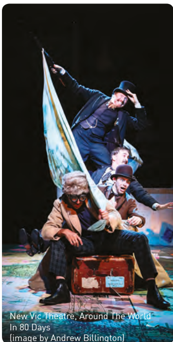
New Vic Theatre, Around The World In 80 Days (image by Andrew Billington)

Live music is on offer at a number of venues throughout the city which host big name bands alongside up and coming bands including those from the local scene.